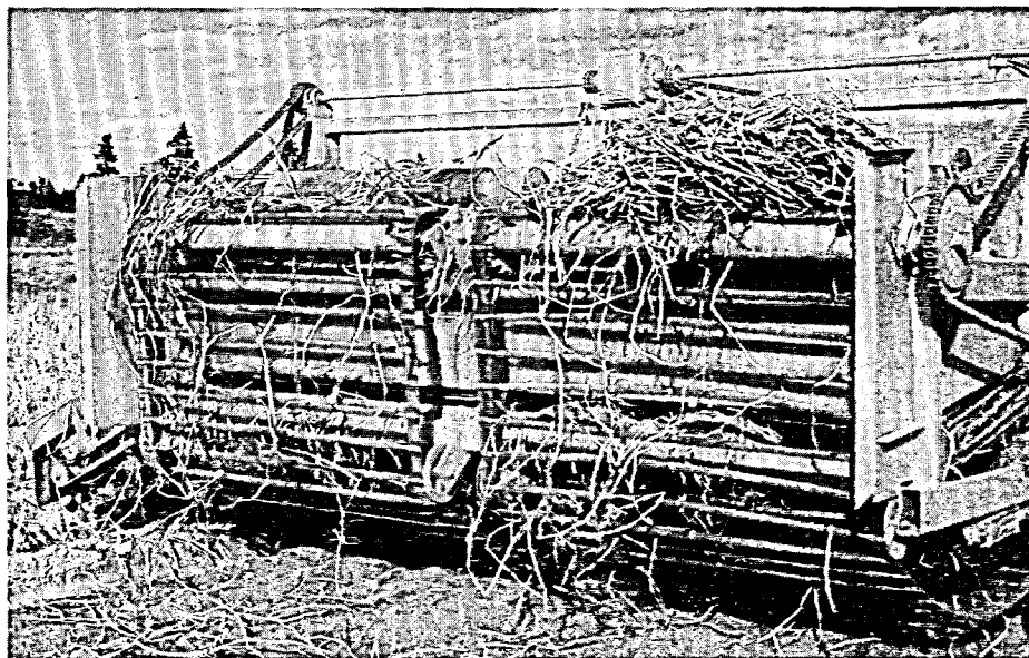
Wevea's DURABELT, the only four-ply belt on the market, is noted for its great strength, its resistance to weathering, and its years of maintenance-free service.