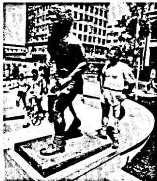
Steven Fonyo in Ottawa beside the statue of Terry Fox.