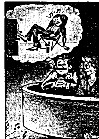
Ottawans spend 60 seconds per day in theatres and concerts.

Leisure Time takes up only 22% of the average Canadian's time. How then do we chose to spend these precious moments? The typical Ottawan spends eight-and-one-quarter hours sleeping, two hours and two minutes watching TV, 22 minutes talking on the phone or in person, 16 minutes on hobbies and "personal expression", nine minutes running or walking, and 60 seconds in theatres or concerts. These facts were compiled in 1981, when Ottawa/Hull was the site of a pilot study to test the methods for the federal government's "Exploration in Time Use" study. The study was done to help determine Canada's cultural policy and...yes, it definitely does say something about our emphasis on cultural activities.