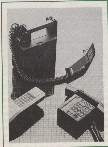
Cantel's portable cellular telephones are available with several options including memory re-dialling for up to 30 numbers, call forwarding and three-way calling.

Mobile cellular radio-telephone service, which allows users to place calls from any location within a cellular coverage area to virtually anywhere in the world, was inaugurated last year in Canada by Bell Cellular of Toronto and Cantel Inc. of Montreal.