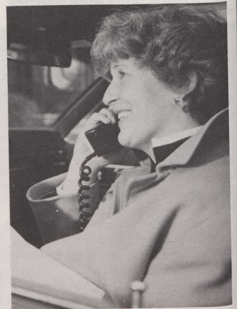
Cellular telephones will save productive work hours for business people and professionals as they can make telephone calls from their automobiles to almost any location.