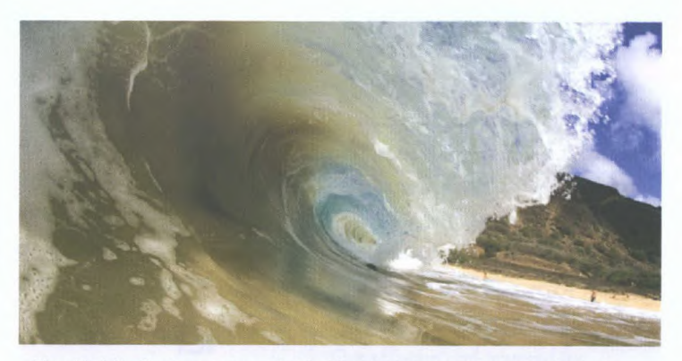
The Middle East ocean market holds exciting opportunity for both the region's own buyers and suppliers as well as the international community.

Provided by the Office of the Chief Economist, Foreign Affairs and International Trade Canada (www.international.gc.ca/eet).