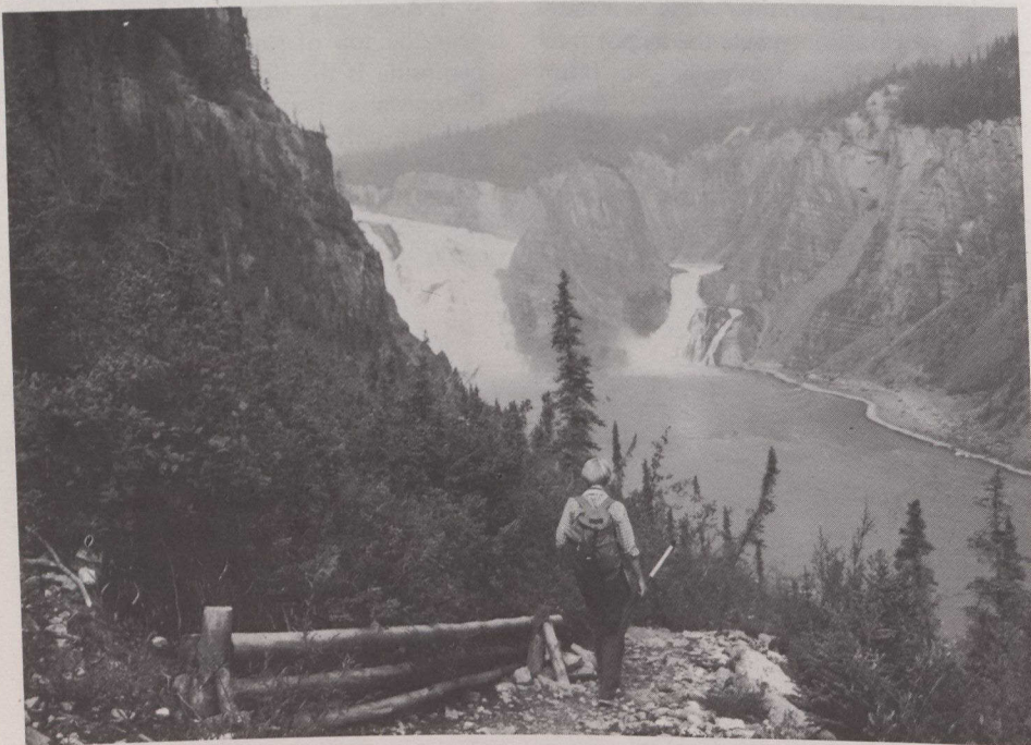
Nahanni National Park in the Northwest Territories is famous for its striking scenery and towering Virginia Falls which are twice the height of Niagara Falls.

Some of the sites already named to the World Heritage list are: the Pyramids of Giza in Egypt; Chartres Cathedral in France; the ancient city of Damascus in Syria; the Galapagos Islands in Ecuador; and Yellowstone National Park in the United States.