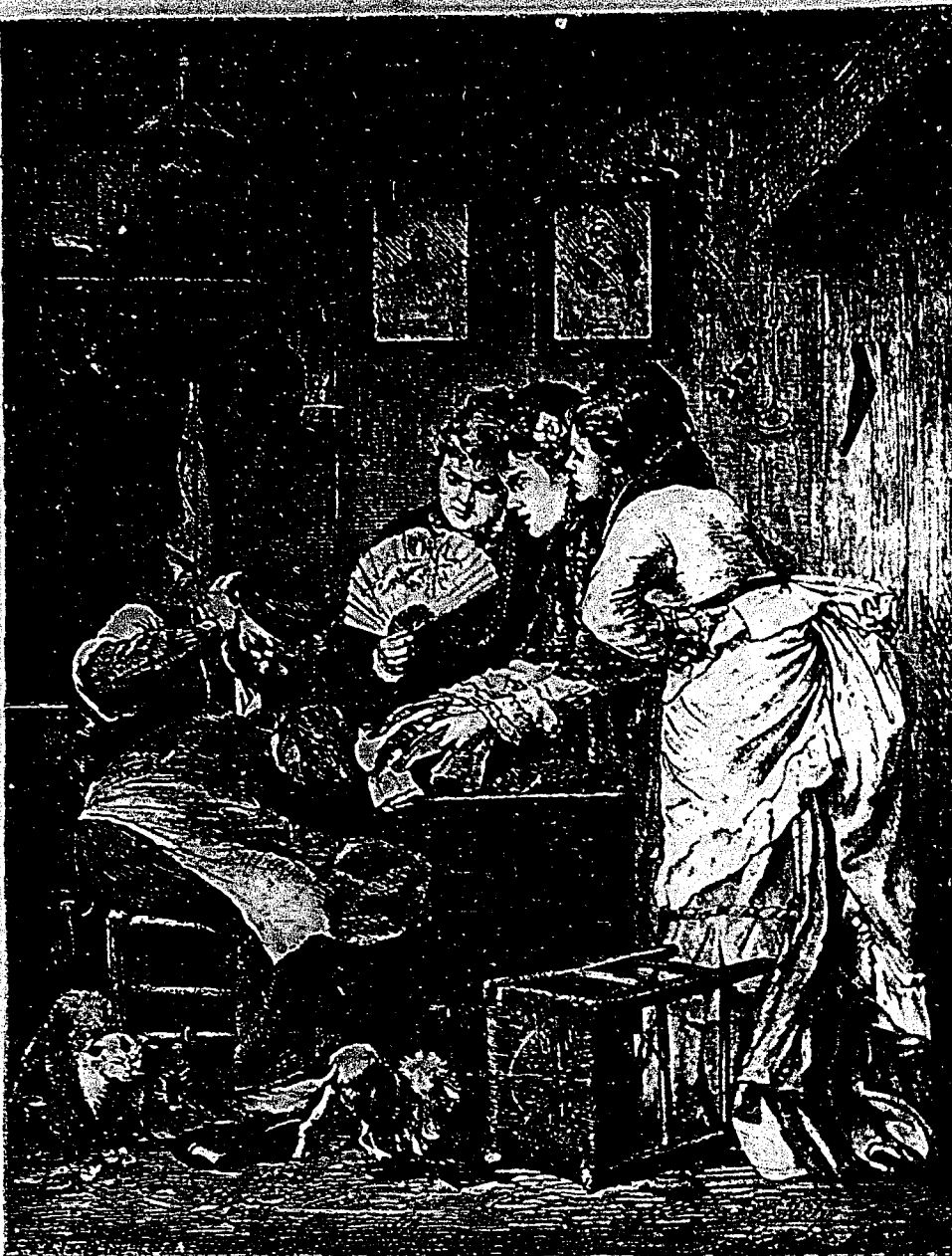
AFTER THE FIRST BALL.

In consequence of spurious imitations of LEA AND PERRINS' SAUCE, which are calculated to deceive the Public, Lea and Perrins have adopted A NEW LABEL, bearing their Signature, thus,