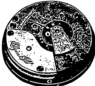
FULL GILT MOVEMENT.

11 Jewels, Compensation Balance, Safety Pinion, Dust Band, Fine Regulator and Index.