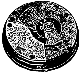
FULL GILT MOVEMENT.

15 Jewels (4 pairs Settings), Compensation Balance, Breguet Hair Spring, Patent Regulator, Adjusted, Safety Pinion.