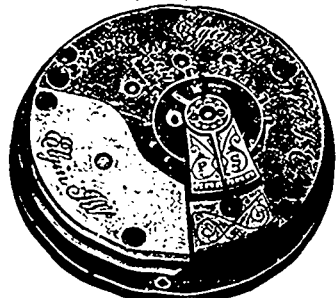
FULL GILT MOVEMENT.

7 Jewels, Compensation Balance, Safety Pinion, Dust Band.