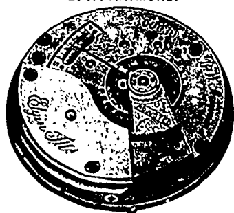
FULL GILT MOVEMENT.

15 Jewels (4 pairs Settings), Compensation Balance, Breguet Hair Spring, Patent Regulator, Adjusted, Double Sunk Dial, Safety Pinion, Finely Finished throughout.