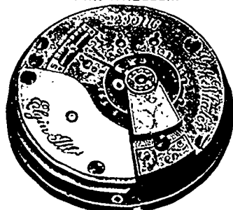
FULL GILT MOVEMENT.

15 Jewels (4 pairs Settings), Compensation Balance, Patent Regulator, Safety Pinion, Dust Band.