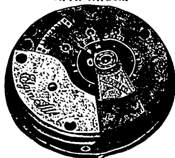
FULL GILT MOVEMENT.

15 Jewels (4 pairs settings), Compensation Balance, Breguet Hair Spring, Patent Regulator, Adjusted, Safety Pinion.