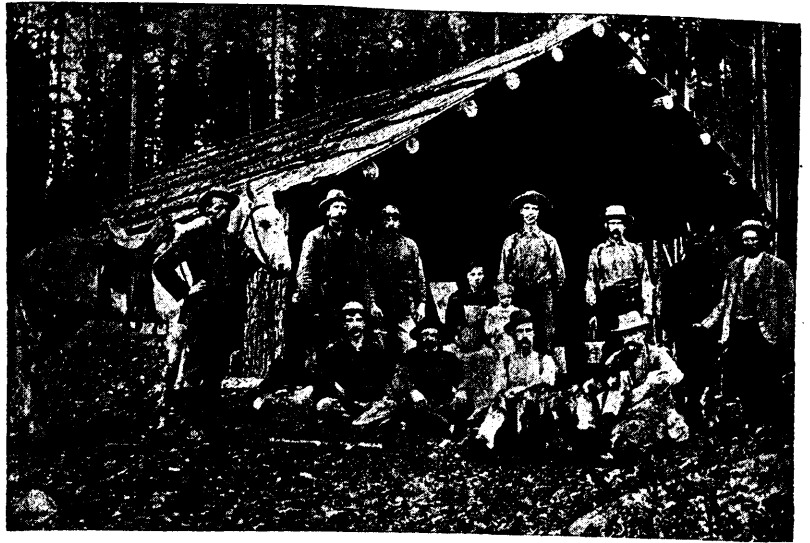
GROUP OF MINERS "VICTORY-TRIUMPH MINE, JULY, 1898.