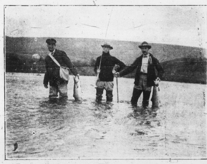
A common sight on the far-famed Margaree