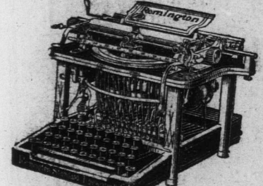
A REMINGTON FOR $50.00.

THAN $50.00, $60.00, OR $80.00 FOR A TYPEWRITER WHEN WE CAN SELL YOU