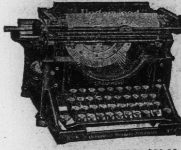
AN UNDERWOOD FOR $80.00.

We have just received another shipment of them, and we have still another on the way. We have sold nearly a half hundred of these machines, and though all of them were sold on a "Money-back-if-not-as-represented" basis, we have yet to have a claim or a complaint. Let us tell you who the purchasers were. Most of them were sold to Water Street firms. Ask for our "Booklet" "What We Do, and How We Do It." It tells how we save you $50.00 to $80.00 on a typewriter. Take a machine, try it for a week or a month, test it in your own office—by an expert if you will—you will then be convinced that you need not pay more than $50.00, $60.00 or $80.00 for your typewriter. Ask us to send you one NOW.