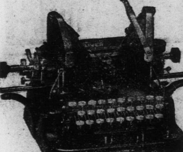
AN OLIVER FOR $60.00.