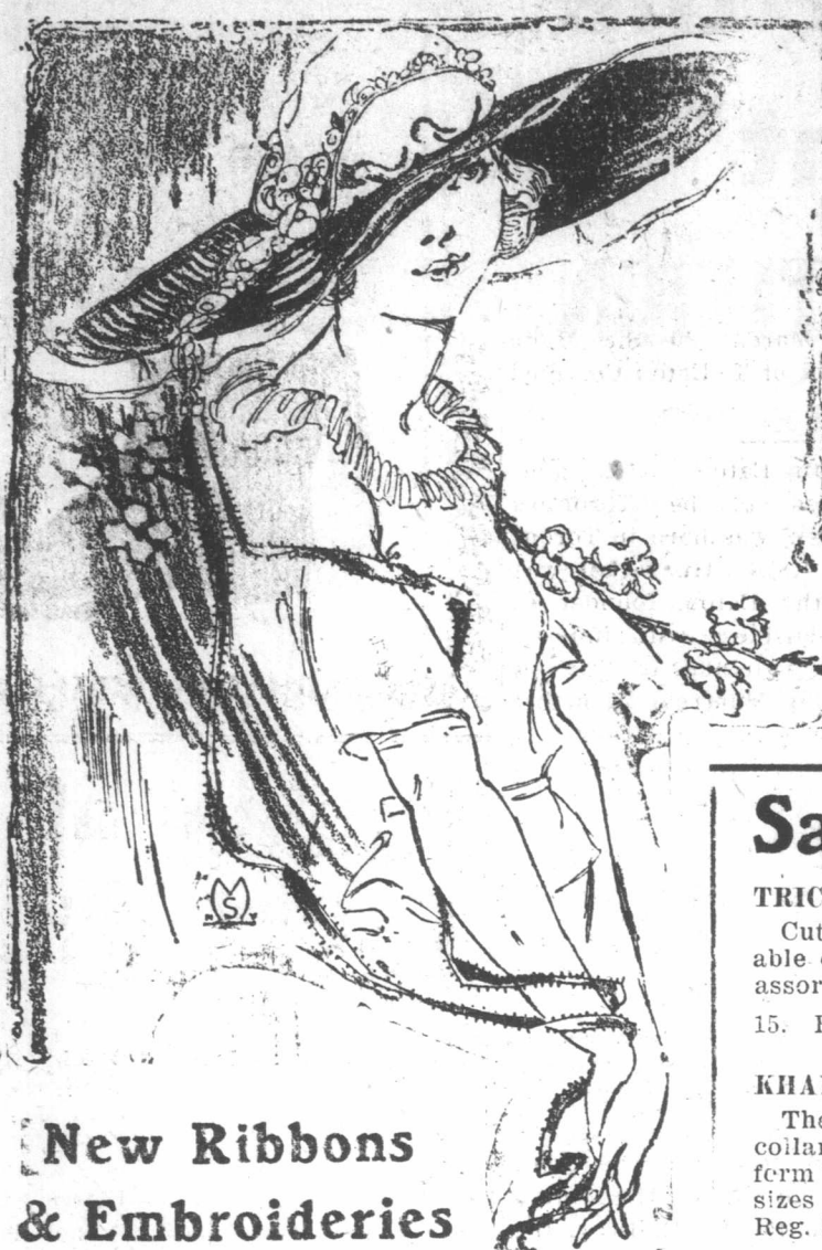
New Ribbons & Embroideries