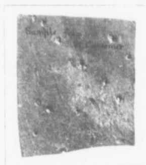
FIG. II.—Actual size of leather, 2\frac{3}{4} in. x 1\frac{1}{4} in.