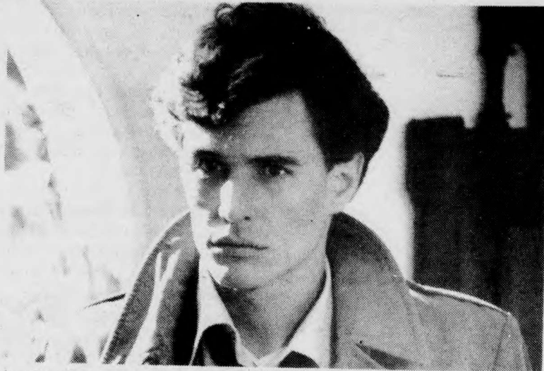
Tom Berenger of "In Praise of Older Women." Based on a 12 year-old book, the film has created a controversy over Ontario's censorship practices, at the beginning of the third Festival of Festivals.

With prominent government people scheduled to be present, and the partial funding of this film by the CFDC, there could have been a confrontation between the federal and provincial officers.