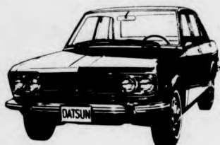
By IAN NEILL