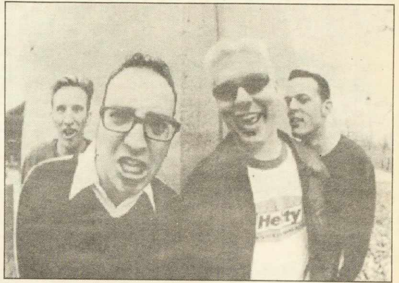
Fumes: Diesel Boy exhausting, leave audience feeling punky.

Big Wig's homepage is at http://subscript.org/bigwig/ and its worth giving these guys a listen. To hear or learn more about the punkalicious wonderfulness known as Diesel Boy go here > www.dieselboy.com