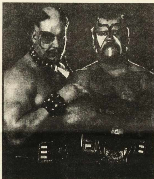
WWF pretty boys Legion of Doom pose for the camera.

The main event between Stone Cold Steve Austin and Shawn Michaels attracted hundreds of media personnel. Continuing the trend for the night, the match failed to reach its true potential. The lacklustre nature of this match can be blamed on bad timing as both of these men were injured before they entered the ring. While attempting simple maneuvers Michaels was unable to mask the sheer pain he was