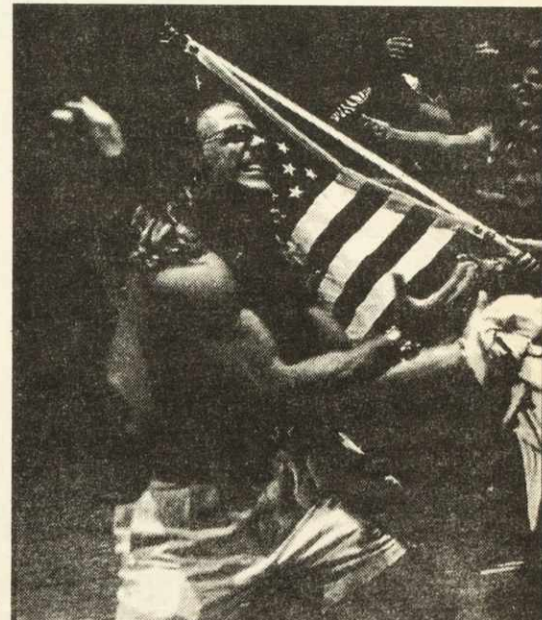
Shawn Michaels hams it up with adoring fans.

On a final note, it's been a pleasure serving as your guide to the wonderful world of professional wrestling for the past year. Any questions regarding the WWF or professional wrestling in general can be sent to the Dartmouth Demon at the Gazette (gazette@is2.dal.ca). But don't piss me off with stupid, idiotic questions, or else I'll put you in the sharpshooter and nail your ass to the wall. If you don't know what