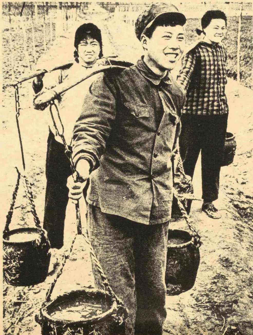
It's a daring new fashion design that just might revolutionize Chinese outerware. Notice the second button to the top is undone! Proponents say this increased exposure is sexier, and definitely anti-Confucius.