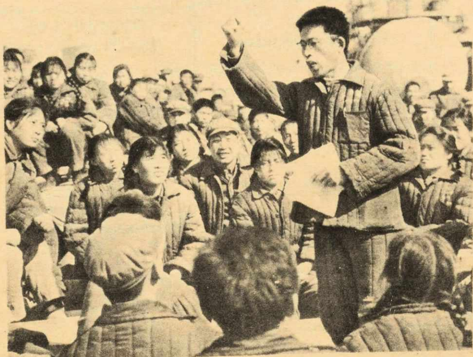
For those cold mornings when you want to warm up the crowd. Comfort plus fashion speaks for itself.