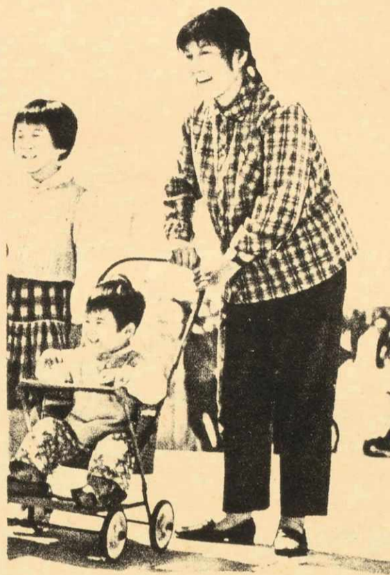
You'll be the envy of all the ladies in this new two piece about-the-town outfit.