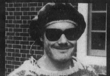
Cameron Did BA V "Encourage the use of industrial hemp."