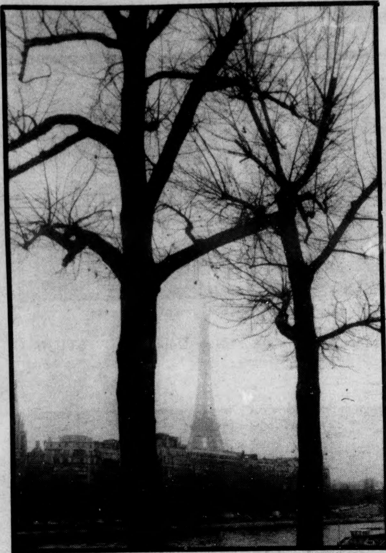
Paris under a dark sky