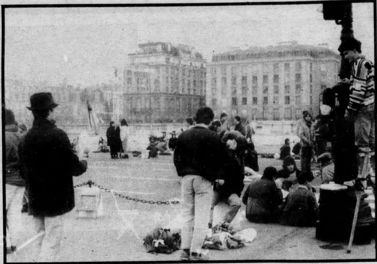
Jugglers and sidewalk merchants gather around striking students