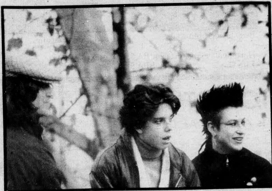
Paris students watch the goings on during peaceful protests against reforms