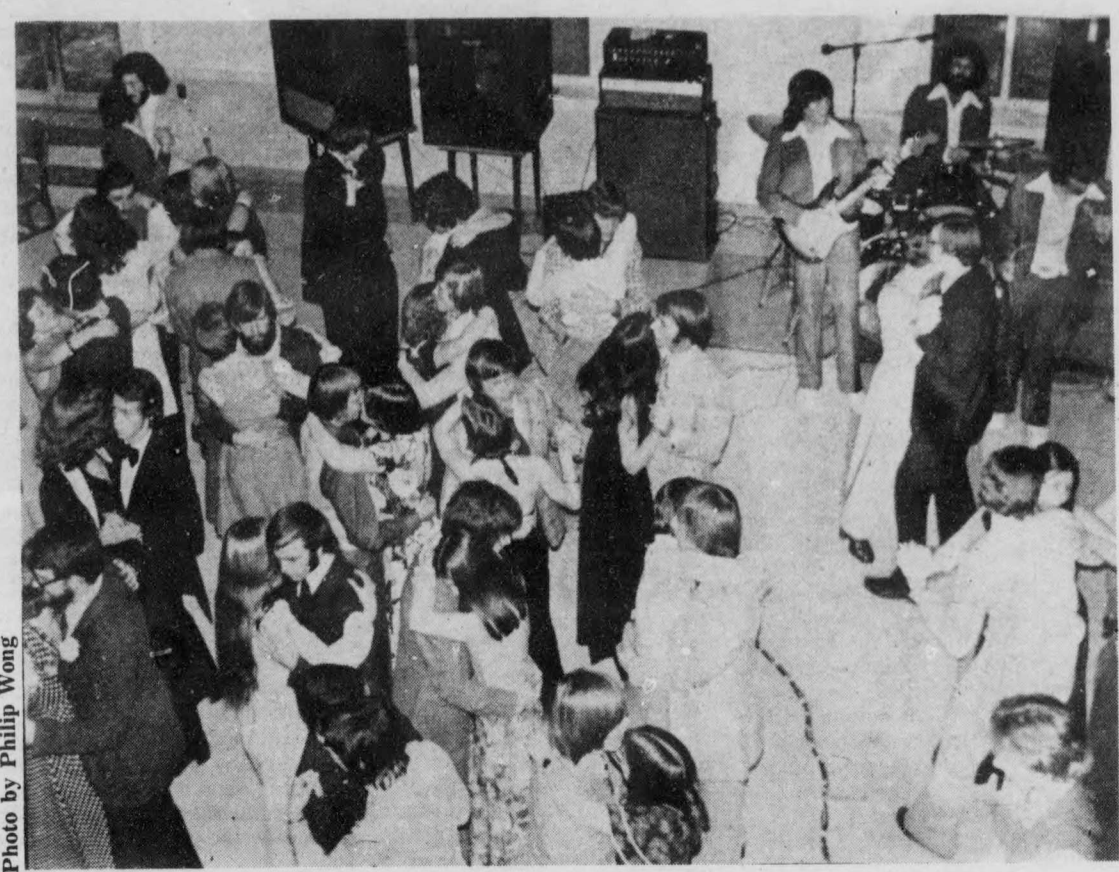
Nobody seems certain how much Winter Carnival events like the above cost the student union. Estimates of the total Carni debt range from $6,700 to $9,000.