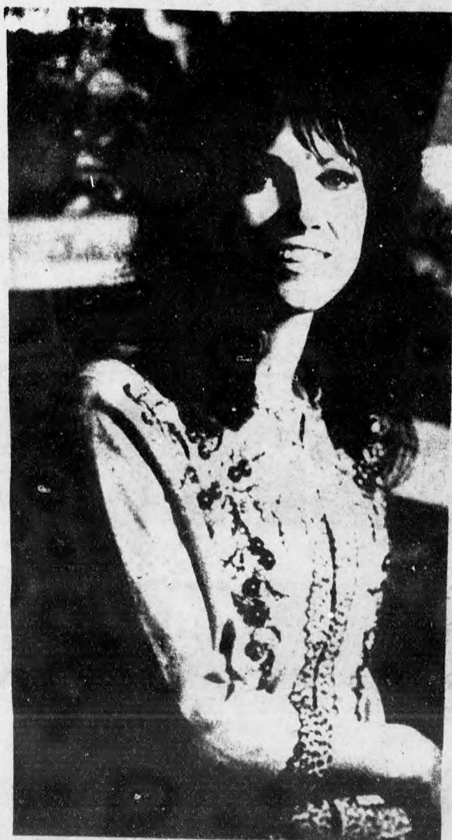
My name is Suzie Gladiator, I live in the weightroom at the gym. I have fourteen different positions. Why not come and try me out.