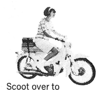
the whole teen-age world.

Sure you love scooters. Records. Folk rock. Dancing. Straight hair. Short skirts. You're natural, you're normal.