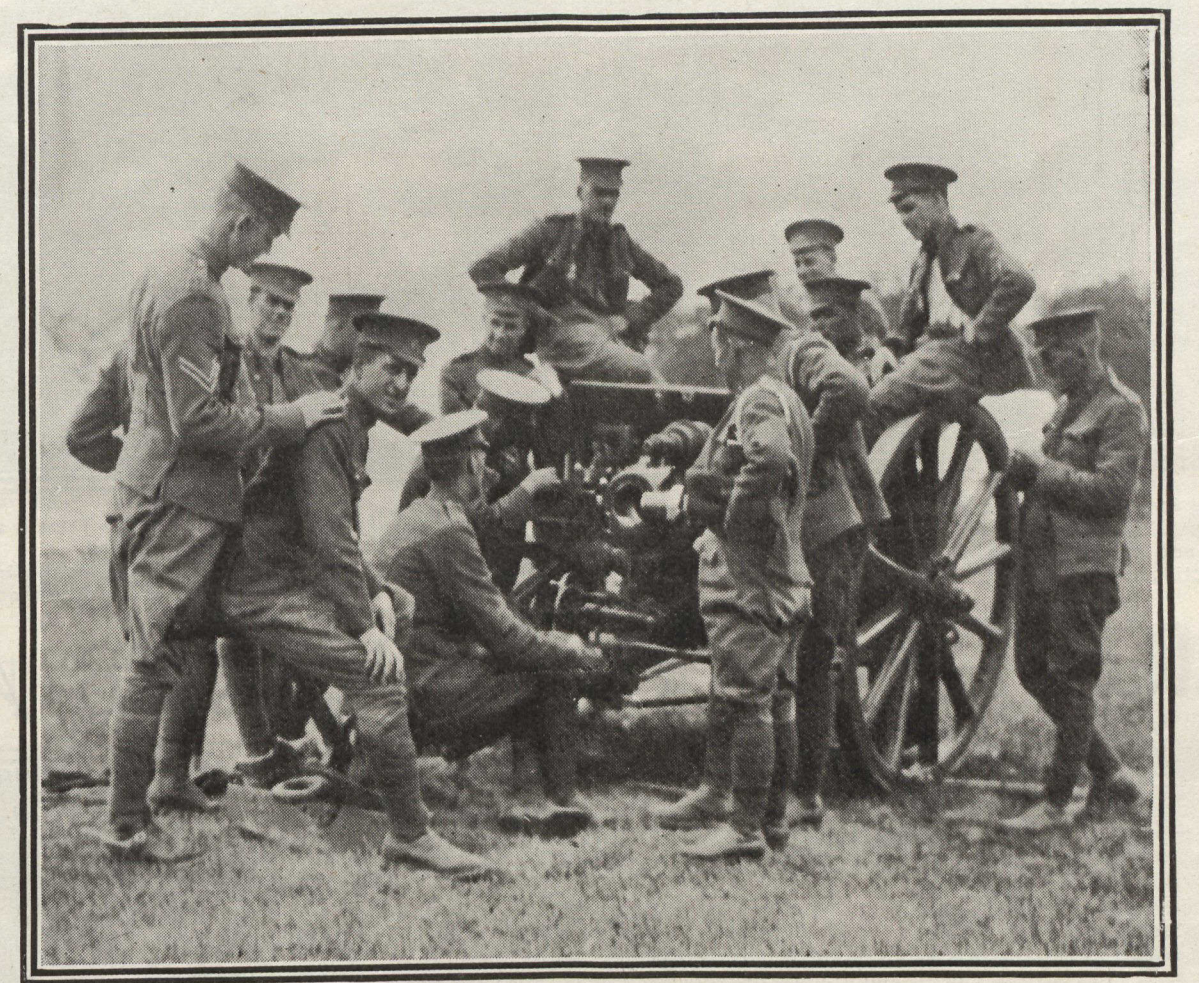
Barriefield gunners examining the anatomy of a field-piece to see how it qualifies for the great Armageddon of artillery in Europe.

and two from each of the Western Provinces. The six batteries of artillery will be divided in the same way across the