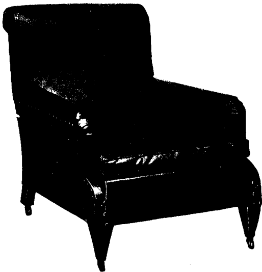
THE NORFOLK (with down filled cushion)

Price in Green Denim ..... $35.00 Price in best quality Hand Buffed Leather. $55.00 Price in English Morocco ..... $75.00