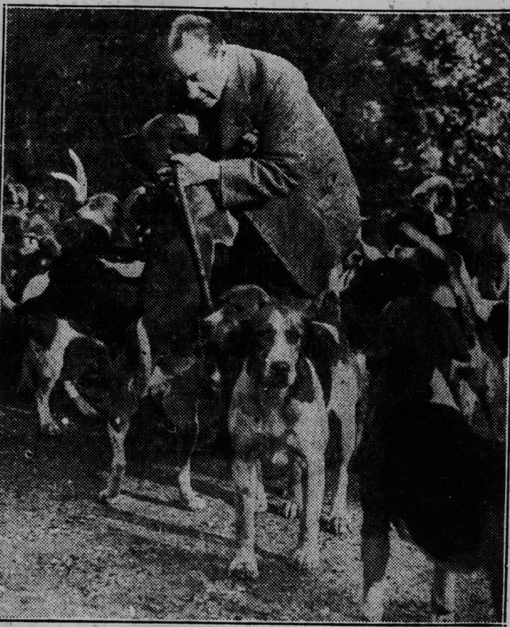
Premier Baldwin has a confidential chat with one of the dogs of the Old Berkeley Hunt Club which met at Cheevers, the official seat of the Premier, as the guests of the Premier and Mrs. Baldwin.

Germany from opposing effectively the miserable treatment of German minorities in Europe.