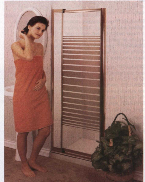
The Series 4000 pivot door is just one of the innovative, high-quality shower and tub doors manufactured by Fasco Products.

These fine tub and shower doors are available in modern, attractive designs and six colour finishes. Fasco also manufactures custom-sized doors to given specifications.