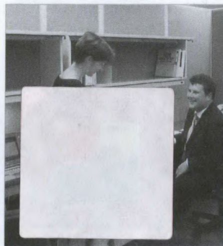
Office space in a Business Support Center in Japan.

BSC staff will also help arrange for the services of interpreters, translators, administrative staff, business travel coordinators, accountants, lawyers, and investment consultants (such as