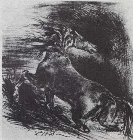
Cheval effrayé sortant de l'eau. Lithograph by Eugène Delacroix (1828).

Thirty-three artists were represented, from the greatest of the French romantic painters, Eugène Delacroix, through well-known contemporaries such as Theodore Géricault, Honoré Daumier, and Baron Gros, to little-known artists like Roque-