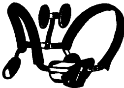
ABDOMINAL AND SPINAL SHOULDER AND LUNG BRACE. FIG. 8.

No. 8 is a general and grateful support to the hips, abdomen, chest, and spine, simultaneously and by itself alone, is ordinarily successful; but when not so particularly in spinal and uterine affections, the corresponding attachments are required.