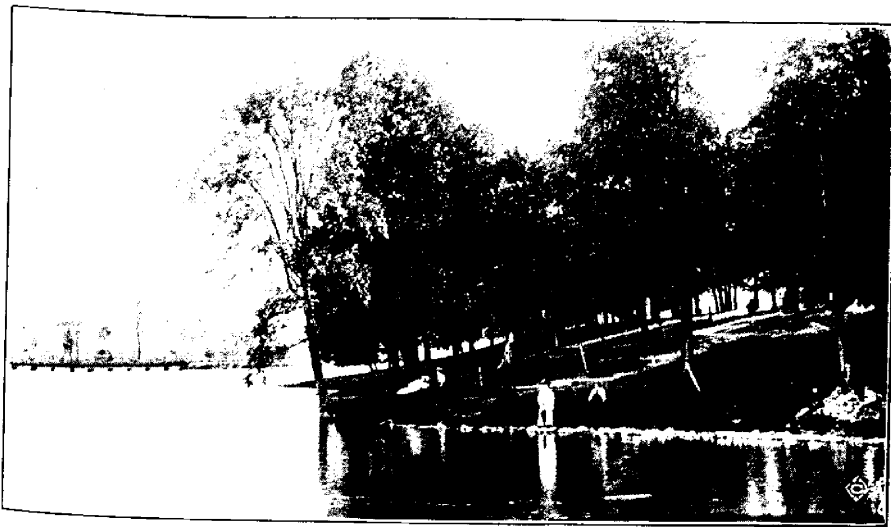
FIG. 1276. --WATERLOO PUBLIC PARK.