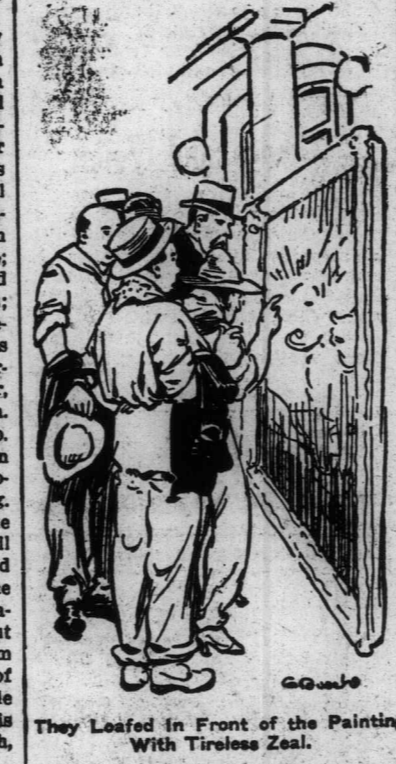
They Looked In Front of the Painting With Tireless Zeal.