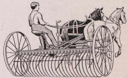
Built for Hard, Quick Work.

Because a Rake looks a simple machine to make don't put up with cheap, inferior workmanship—get a Frost & Wood and save real money. Teeth of special quality tempered steel, and arranged in convenient sections of two or three. Self-dumping, discharging load automatically at light pressure on foot lever. Made of steel, amply strong, clean working, the Frost & Wood Rake gives a lifetime of splendid service.