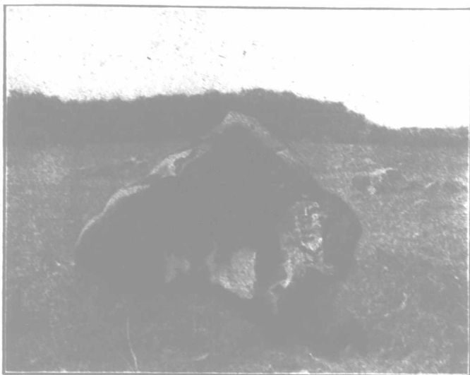
See what was done with this boulder by using Stumping Powder.