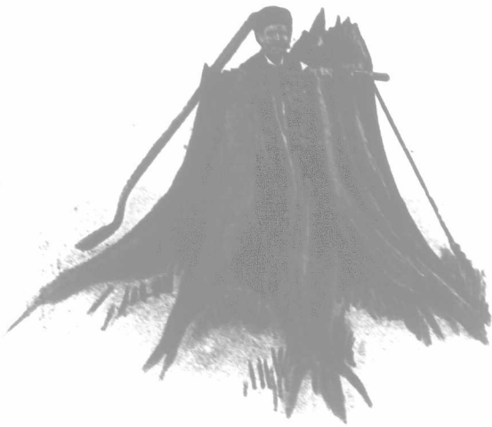
See what happened to this stump by using Stumping Powder.