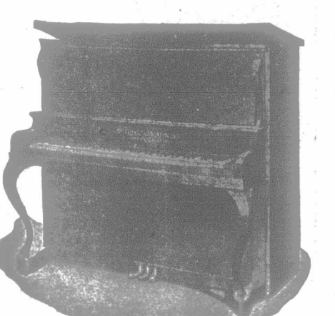
Louis XV-Style 130.

By writing us at once, you will be able to get one of our splendid exhibition samples, and we will deliver it to you either at once from the exhibition stock now ready, or else straight from the exhibition when it is over.