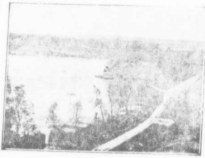
A Glimpse of the Toronto-Hamilton Concrete Highway—Along Burlington Bay—"A Road for a Century."