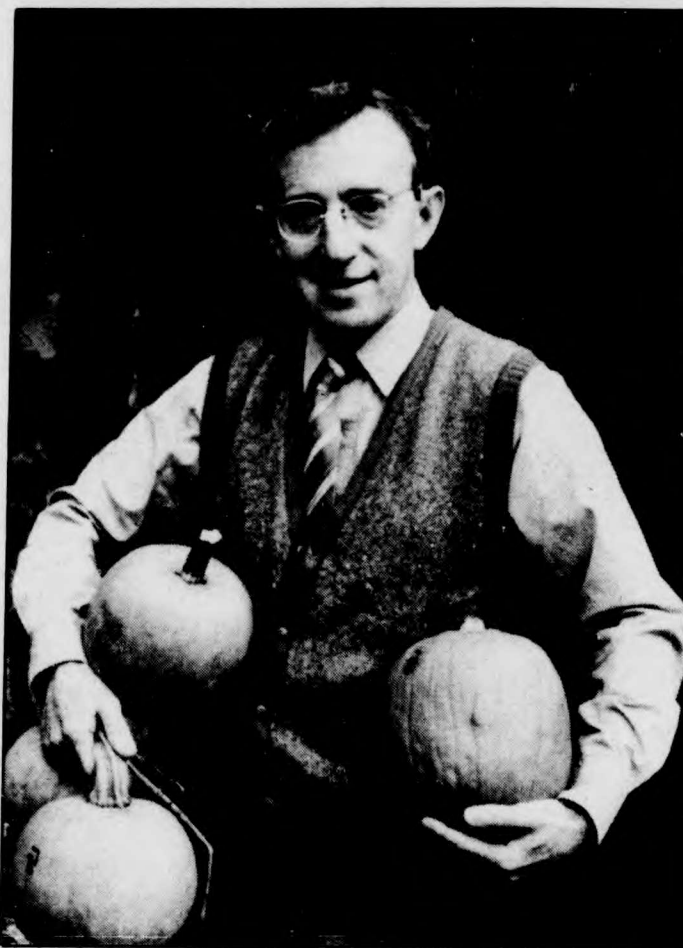
Woody Allen (pictured here in Zelig ), has become a minor deity when compared to other American film comedians. His new film continues his tradition of excellence.

In the first place, Allen has removed himself completely from the onscreen happenings, producing his first film since Interiors in which he himself does not appear. Difficulties the viewer might have with the old Woody are eliminated by removing the familiar image, leaving Allen free to explore new ground from a