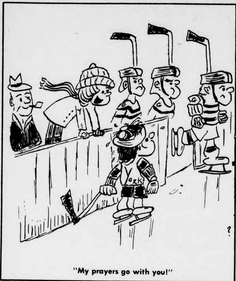
Cartoon from Metro Sports