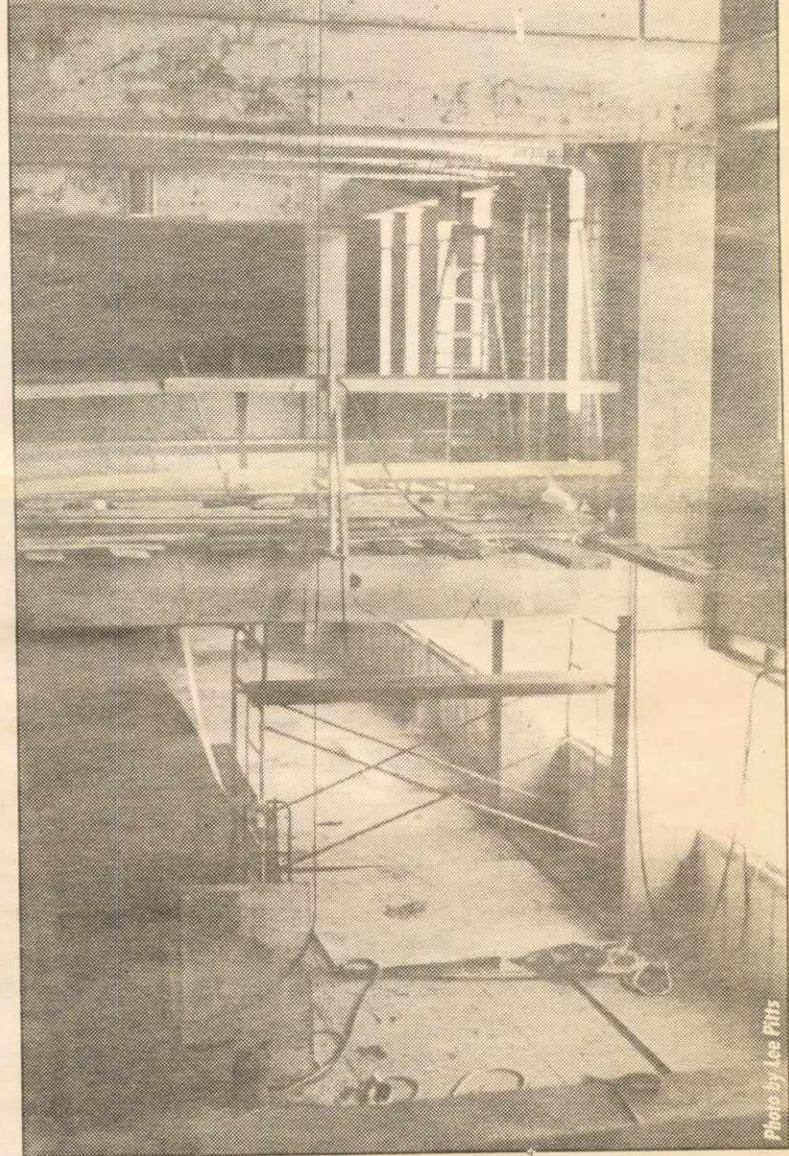
Weird science: construction continues on the new Computer Science Building