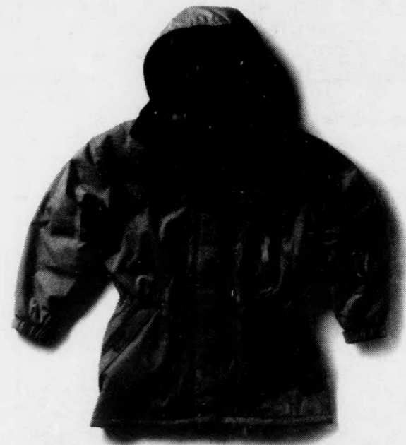
Saginaw II Parka™

In the Pacific Northwest, we make popular parkas designed to stand up to ever-changing weather, not ever-changing fashion fads. Our Saginaw II Parka™ is a case in point. It features a Bergundtal Cloth™ shell with an Alpen Plus Fleece™ lining, Radial Sleeve™ design, and detachable fleece-lined hood.