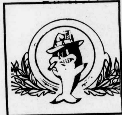
"They help fund this 'priceless' paper" The Bruns Shark