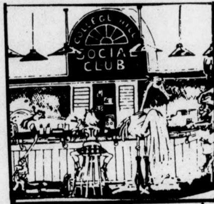
"They sure as F--- don't give us any!" Matt Social Club