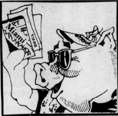
"They sent me to Florida!" S.M.A.R.T. P.A.C.C. PIG

Q. What do you think UNB does with all their money?