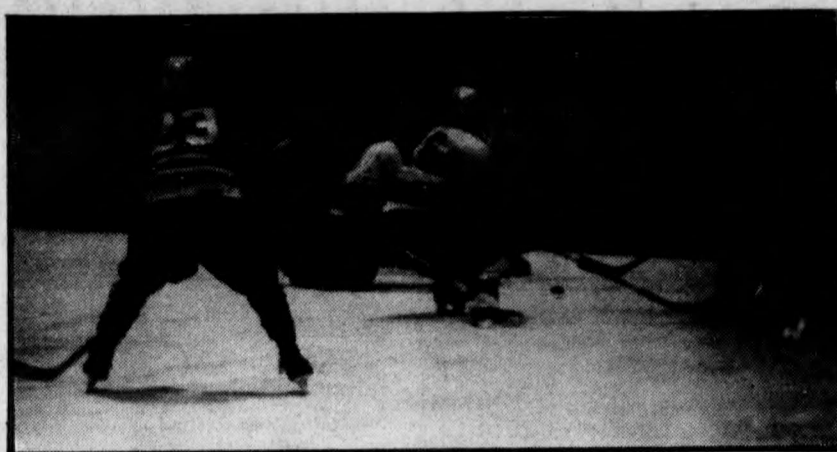
Pressure applied by the Devils during game against STU Wed night