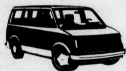
GMC Safari Passenger Van