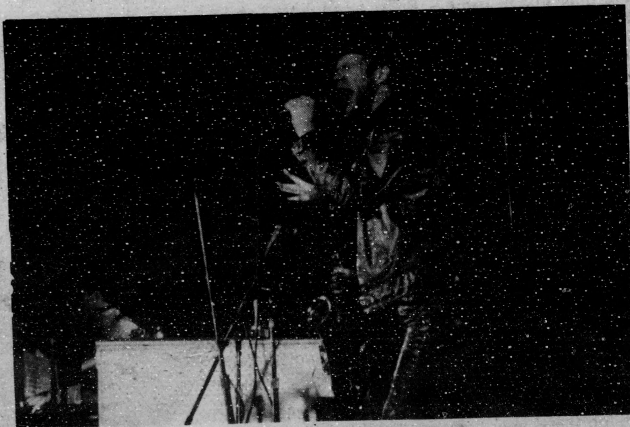
Long John Baldry

A crowd of some 3,000 attended the Long John Baldry and Minglewood concert at the Aitken Centre last Friday.