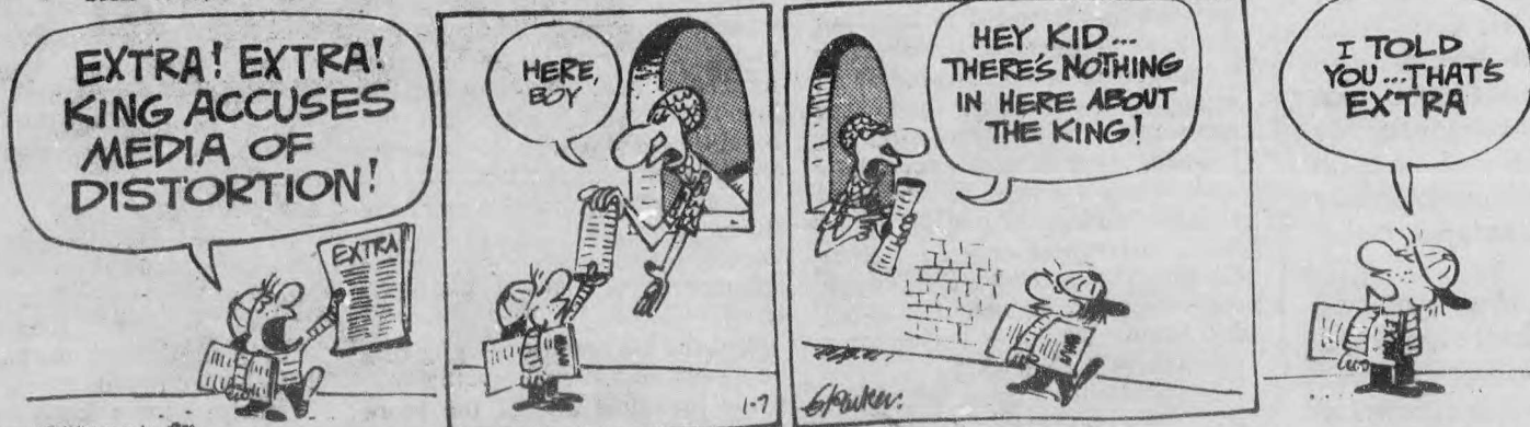
by Brant Parker and Johnny Hart