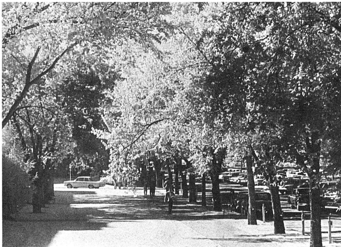
ANY FOOL CAN BUILD A TREE . . . but it takes a special genius to plant a tunnel