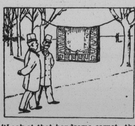
E O. C