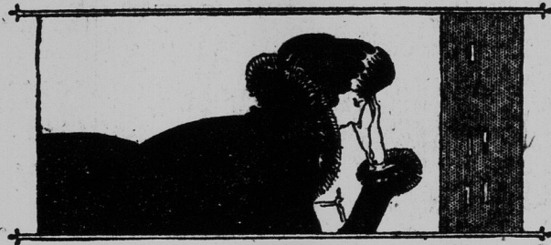
She keeps her skin smooth, fresh in spite of coarsening winds and dirt

Wind and dirt age a woman's skin— In the world's big cities women use this famous method to keep their skin fresh and supple