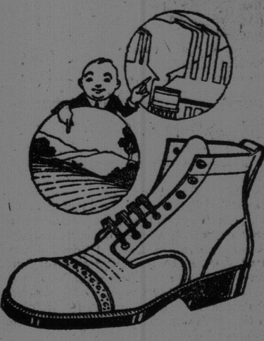
For Farm or Factory—comfortable, serviceable work shoes.

Heavy Work Boots in Brown or Black .....$3.95 up Waterproof Boots for the Business Man .....$3.95 up Reliable Footwear at Fair Prices.