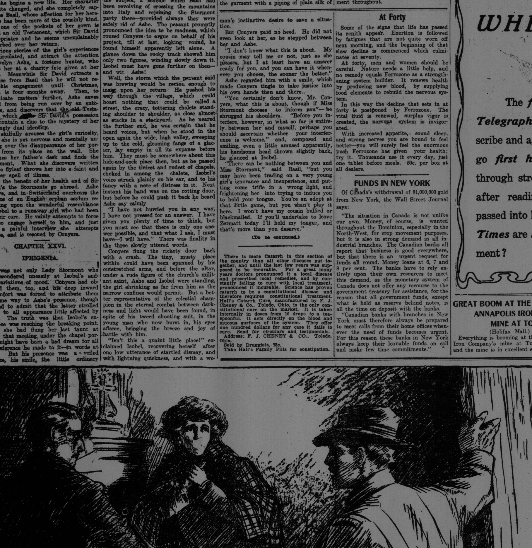
"He did not even look at her as he step ped between her and Ashe."

(Halifax Mail.) Everything is booming at the Annapolis Iron Company's mine at Torbrook now, and the mine is in excellent shape. Num-