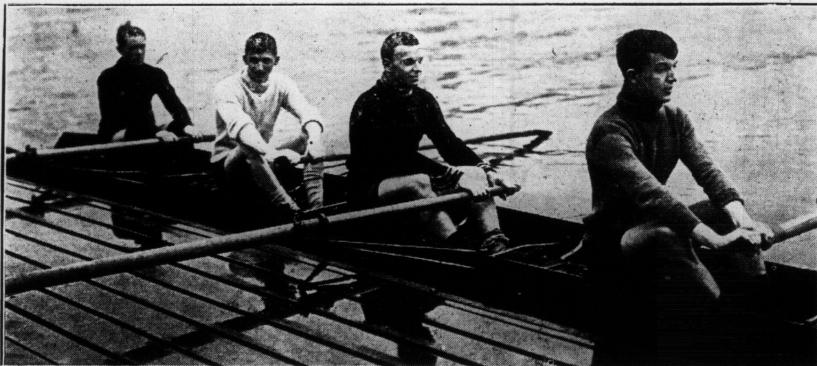
ARGONAUTS' JUNIOR FOURS AT PRACTICE.