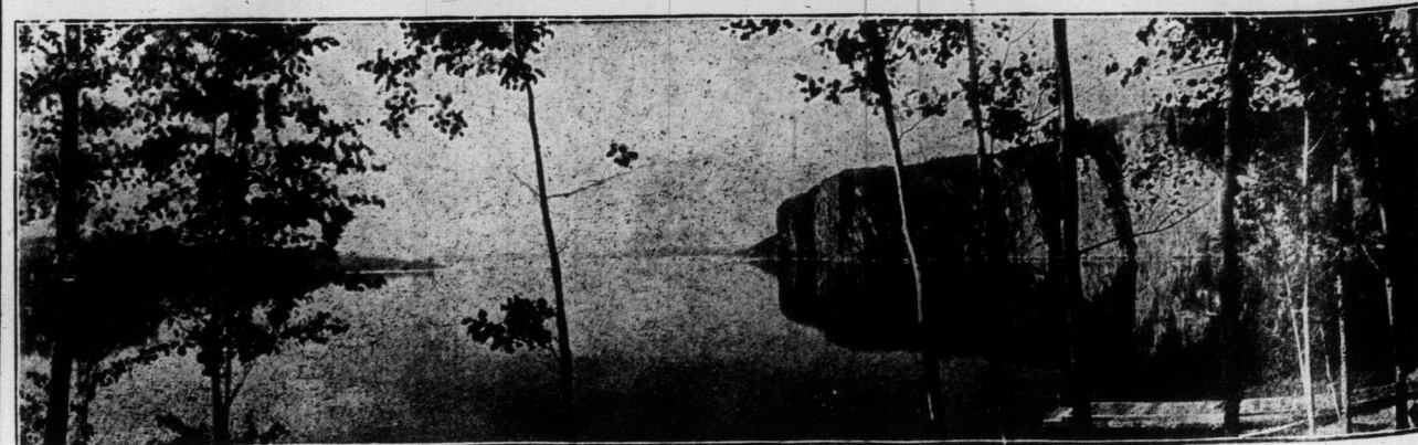
A MILE OF BON ECHO BLUFF IN ONTARIO HIGHLANDS