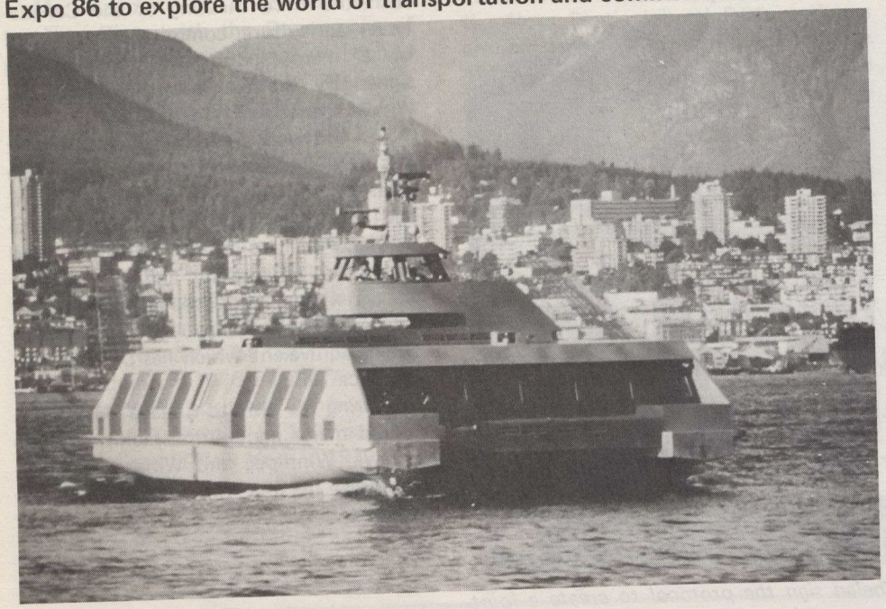
A "sea bus" will carry visitors to the second site.

Canada's gateway to the Pacific, Vancouver, will be the site of the 1986 International Exposition to be held from May 2 to October 13.